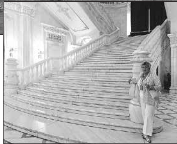
Scenes of Bucharest